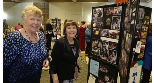
Pictures, memorabilia, and catching up with old friends was the order of the day.