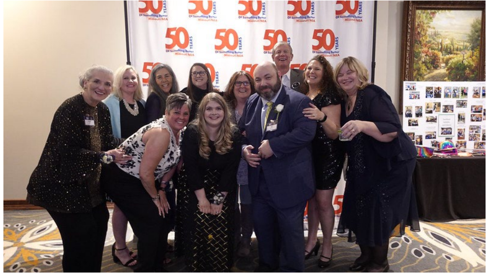
Missouri NEA Staff